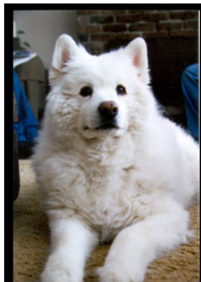
Yogi April 2001 - July 2004

You were happy just to be with us, wherever and whenever we would go.