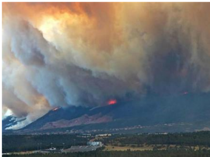
Waldo Canyon Fire in Colorado Springs, CO

Created in the wake of the 9/11 terrorist attacks to honor the work of the search and rescue K-9s who bravely served, the AKC CAR Canine Support and Relief Fund is a permanent charitable fund that has donated more than $4 million to SAR teams and to organizations supporting companion animal relief during natural disasters. For more information, visit www.akccar.org .