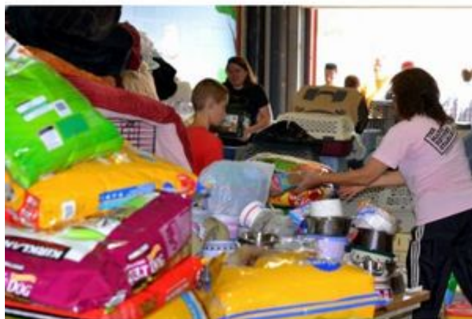
Humane Society of Pikes Peak Region gathering supplies