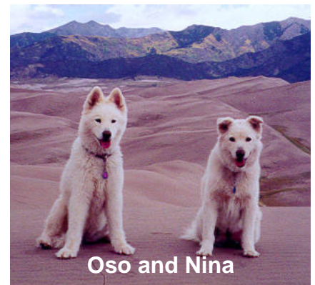
Oso and Nina

Female (Oso) 8 yr House/Outdoor Owner Comments: 52#. OK with dogs, and children. Responds to basic obedience commands, walks well on a leash. Nice looking girl! Very elegant attitude, quiet demeanor. Likes to hike. Will be placed together with Nina, see below. Why: Owner surrender - moving into town home with no yard