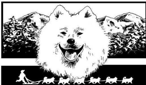
Denver Samoyed Association, Inc.