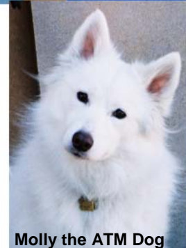
Molly the ATM Dog