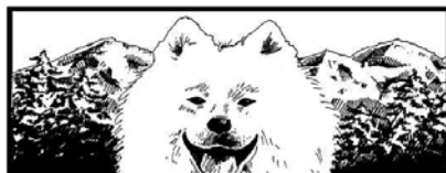
Denver Samoyed Association, Inc.