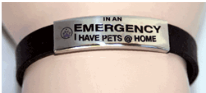
Alapet Pet Alert Bracelet come in a variety styles and colored bracelets.