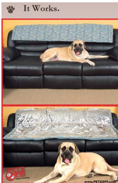
Petzoff throws with aluminum coating on one side help keep pets off your furniture.

And if you're traveling but want to give your pets controlled access to outside areas of your home, the Catwalk and Dogwalk Pet Doors ( catwalk-petdoors.com ) have taken remote-controlled garage door technology inside the home. A miniature remote control unit that fits onto the collar can be specially programmed to give individual pets different curfews to outside areas. The door slides horizontally upwards and stops if the pet is in its path. The codes can be set to accommodate multiple pets. Currently, if Fido is allowed out to play all day and Fluffy isn't, there's nothing to stop a second pet from queuing behind and sneaking out. But the New Zealand based company is working on it!