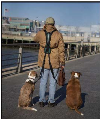
Alpha Pac harness system allow you to walk multiple dogs at a time—hands free!

Whether you're on a casual Sunday stroll or a sightseeing trip with your dog, the Alpha Pac ( thealphapac.com ) is a harness system that allows humans to handle multiple animals — hands-free.