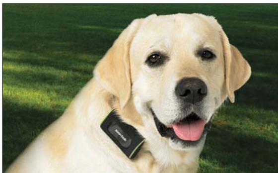
Zoombak Dog Locator is attached to the pet's collar.

The Zoombak Dog Locator ( zoombak.com/ )