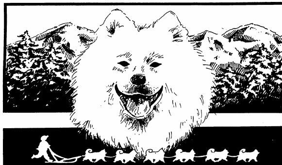
Denver Samoyed Association, Inc.