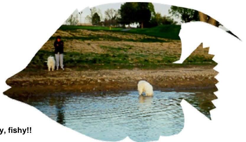
Heeere fishy, fishy!!