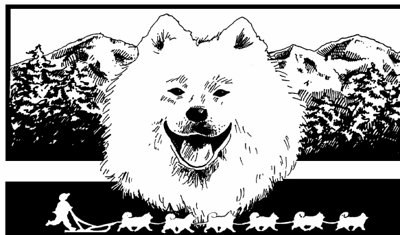
Denver Samoyed Association, Inc.