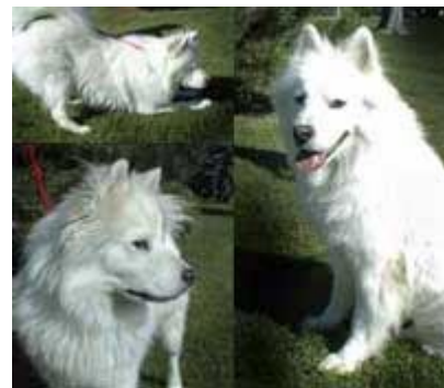
Smudge's many facets!